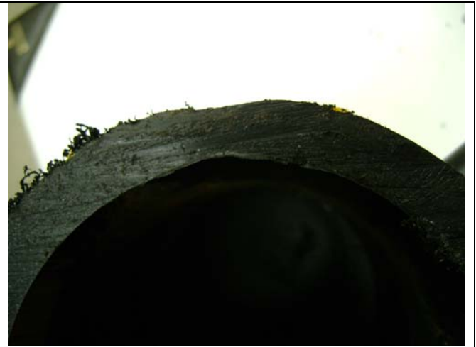
Fig.2 Thin wall thickness of PE 80B approx. 10 mm