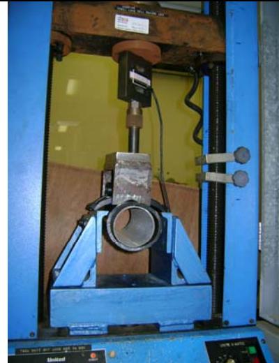
Fig.4 Compression method of testing the saddle/pipe joint sample