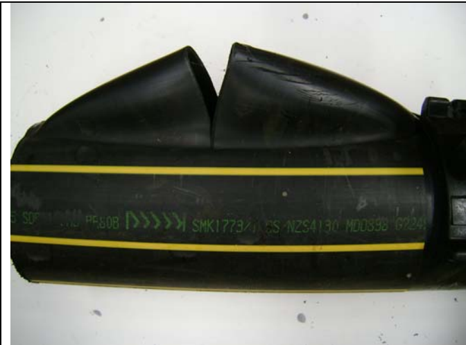
Fig. 1 Burst PE 80B pipe