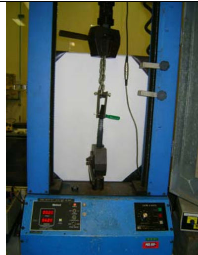
Fig.6 Tensile method of testing the cap/pipe joint samples