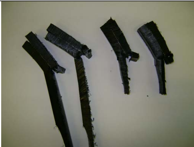
Fig. 5 Fusematic cap/pipe joints failed in ductile mode