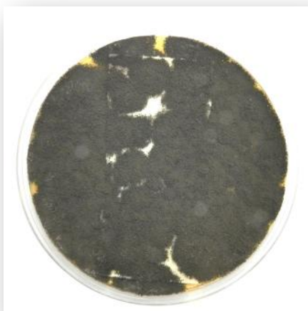
Untreated surface protection