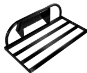
Mini Carryall Leveller also available