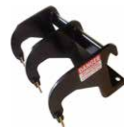
Mini Ripper also available