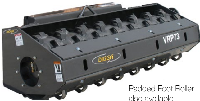
Padded Foot Roller also available