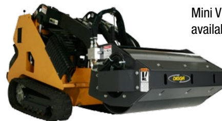
Mini Vibratory Roller also available for mini loaders