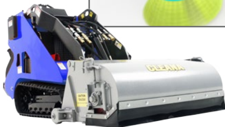
Mini Broom also available